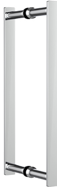
Double Door Handle shown with a small Rosette